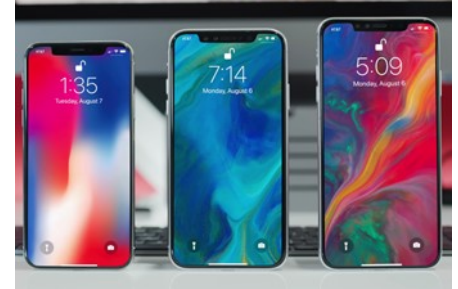
New iPhone XR, XS, and XS Max

The consensus on Apple's products is that they are top of the line technology but have a price tag that is too big for many people.