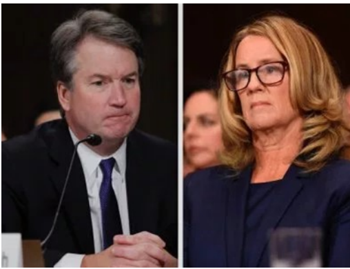
Kavanaugh and Blasey Ford pictured during their testimonies.

President Donald Trump's Supreme Court nomination of Brett Kavanaugh on July 9 th , 2018 did not seem very controversial at the time of its announcement. However, on September 14 th Dr. Christine Blasey Ford came forward anonymously in an article with The New Yorker, accusing Kavanaugh of sexually assaulting her at a party in 1982. These allegations have put a major road block in the path to Kavanaugh's confirmation to the Supreme Court.