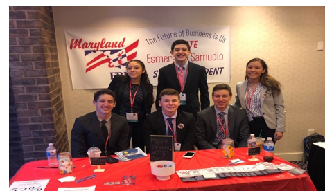
Franklin High School FBLA members at the State Leadership Conference. March 2018.