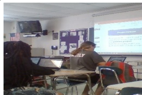
Franklin students using their own individual laptops