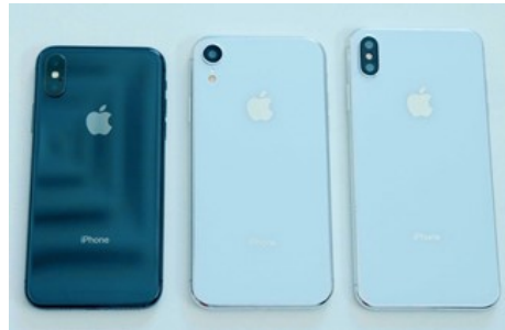
The backs of the new iPhones